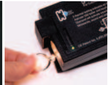
Tester Model 590